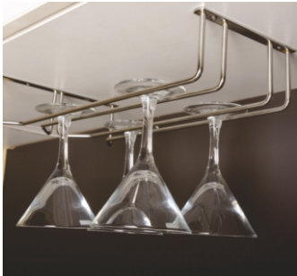
Wine Glass Holder - Double