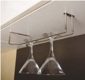
Wine Glass Holder - Single