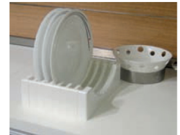
On the Platform