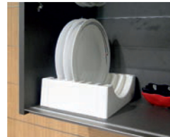
In Overhead Unit